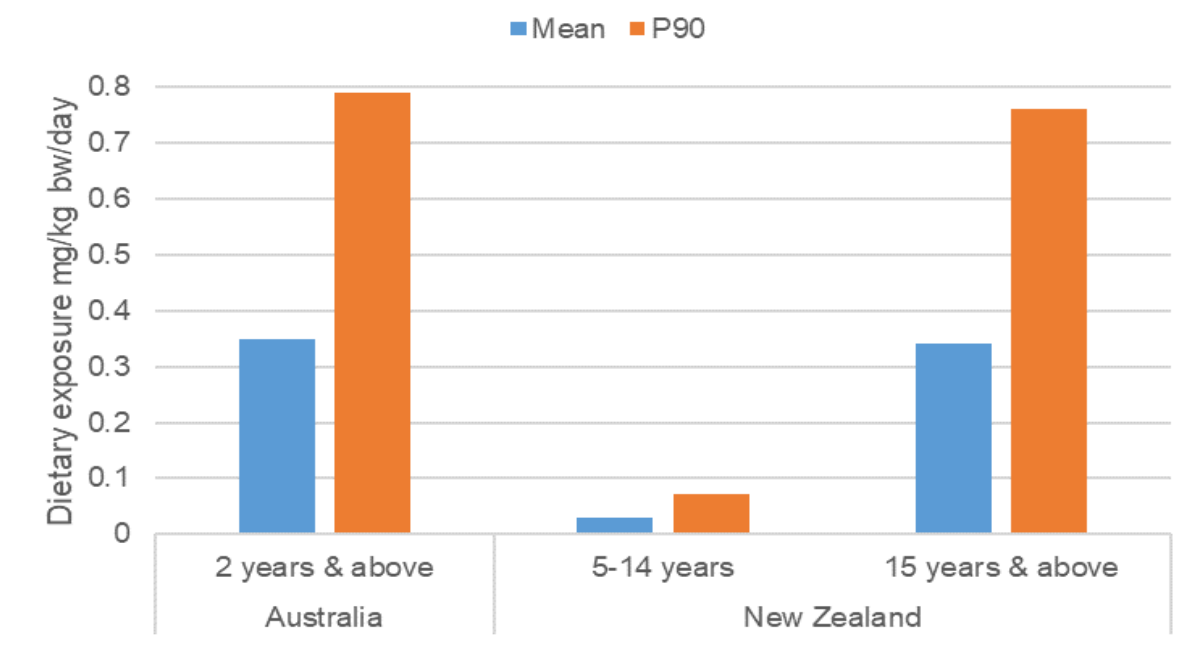
Figure 2 Estimated mean and 90th percentile (P90) daily dietary exposures (mg/kg body weight/day) to potassium polyaspartate for Australia and New Zealand consumers only